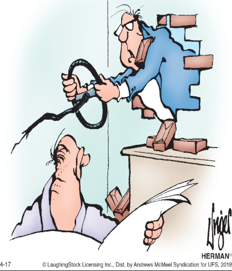
"The old brakes failed!"

NOTICE IS FURTHER GIVEN that the real property and improvements concerned with herein will be sold subject to any and all patent reservations, easements, all recorded and unrecorded liens not foreclosed herein, and all recorded and unrecorded special assessments and taxes that may be due. Plaintiff and its attorneys disclaim all responsibility for, and the purchaser at the sale takes the property subject to, the valuation of the property by the County Assessor as real or personal property, affixture of any mobile or manufactured home to the land, deactivation of title to a mobile or manufactured home on the property, if any, environmental contamination on the property, if any, and zoning violations concerning the property, if